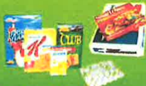
Boxboard, Cereal boxes Frozen Food Boxes