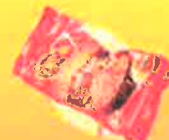
Frozen Food Bags