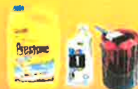
Hazardous or Toxic Product Containers