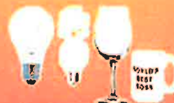
Light Bulbs, Drinking Glasses or other Glassware