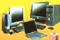
Batteries or Electronics

DO NOT put these items in your recycling cart.