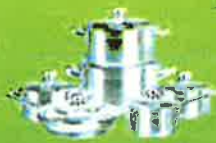
Pots & Pans, Scrap Metal, Ceramics