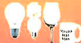
Light Bulbs, Drinking Glasses or other Glassware