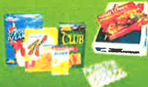
Boxboard, Cereal boxes Frozen Food Boxes