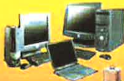
Batteries or Electronics

DO NOT put these items in your recycling cart.