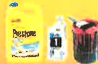
Hazardous or Toxic Product Containers