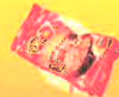
Frozen Food Bags