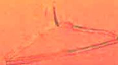
Plastic or Metal Hangers