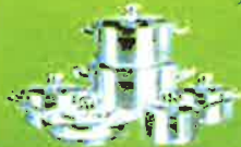
Pots & Pans, Scrap Metal, Ceramics